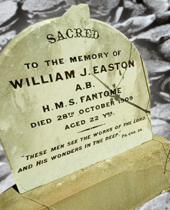
Gravestone at Shenton Bluff, Cygnet Bay Pearl Farm

Donnelly McKenzie sorting pearl shell.