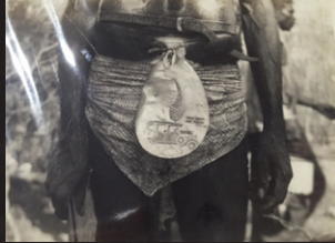
A significant riji of the Wiggan family dynasty